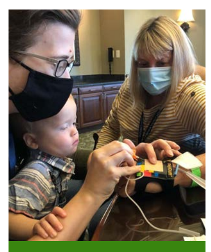
With your support, he will be able to live in a world free of Bleeding Disorders.

To be recognized as a leading organization, providing valued services; as ambassadors of public outreach to enlighten and foster an understanding of what matters most to those affected by hemophilia and bleeding disorders; and to be our community's first choice in partnership to achieve their highest potential through empowerment, connection to their community, and being part of the solutions that affect them the most, UNTIL a cure is achieved.