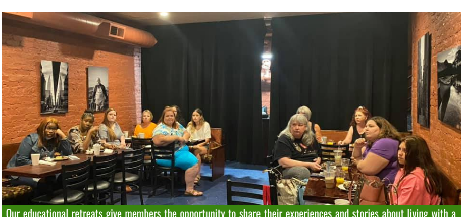
Our educational retreats give members the opportunity to share their experiences and stories about living with a Bleeding Disorder.