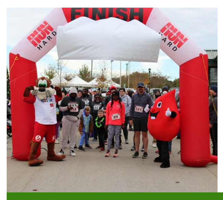
Our STEP for Bleeding Disorders walk is an opportunity for the community to come together and raise awareness of Bleeding Disorders to the public at large.