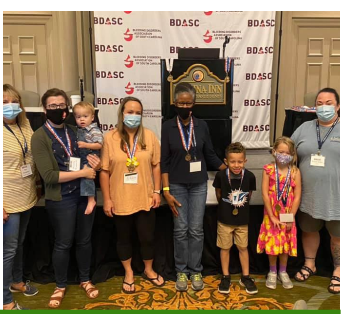
After two years of virtual programming, we are gradually returned to in-person events.